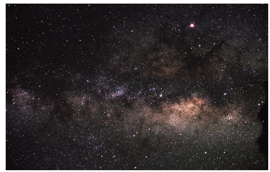
Photograph of the starry sky over La Palma taken on April 20th, 2007, the night when the Starlight Declaration was adopted.